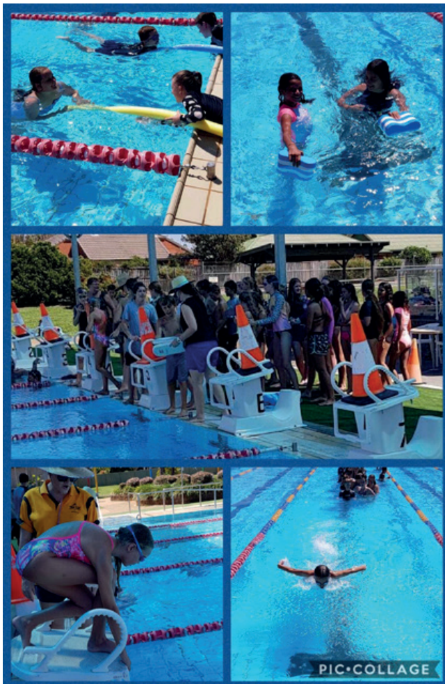
Year 7 keeping cool last week at the pool during their Aquatics Unit in PDHPE.