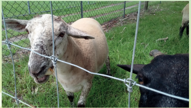
Snowy (that's him)

I'm a six year old Dorper Ewe. I need a loving, caring home, with lots of grass (as I love it) and I'm very friendly :)