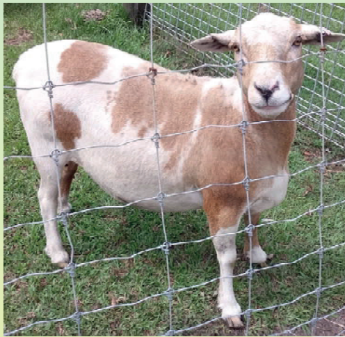
Bambi (that's me)