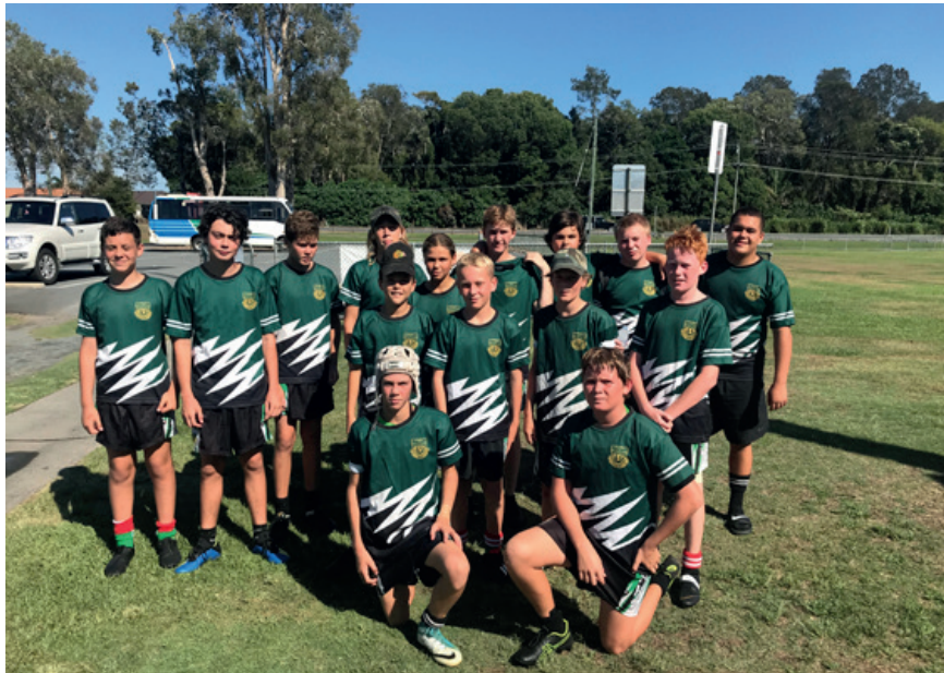
U14 Buckley Shield Rugby league team