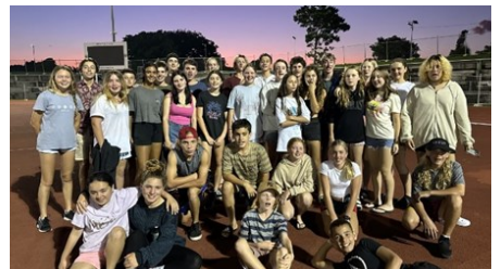
The 2022 SDP camp participants.