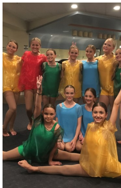
NSW State School Spectacular

Students have the opportunity to further develop their soccer skills at the Gold Coast Performance Centre during the Sport Excellence camp and their refereeing skills at Primary School gala days.