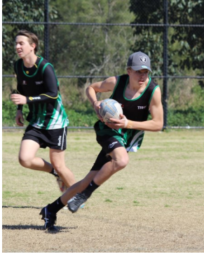
NSW State Touch Champions