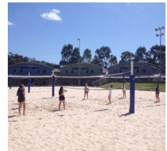
Gold Coast Performance Centre