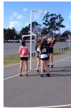
Tweed Regional Netball Centre

SDP Netball is conducted at the newly refurbished Arkinstall Park and at TRHS's Sport and Entertainment Centre.