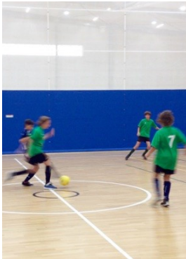
"Futsal is the five-a-side soccer game, mainly played indoors. The game is very popular across