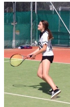
Arkinstall Park, adjacent to TRHS

SDP tennis students have gained FNC, NC and CHS State selection.