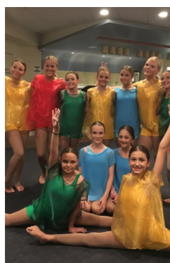
NSW State School Spectacular

Students have the opportunity to further develop their soccer skills at the Gold Coast Performance Centre during the Sport Excellence camp and their refereeing skills at Primary School gala days.