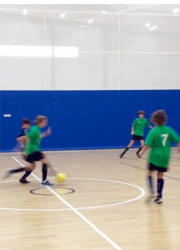
"Futsal is the five-a-side soccer game, mainly played indoors. The game is very popular across South America."

Our students have captained the Open NSW Boys and Girls state sides, one to National Victory and coached other TRHS students.