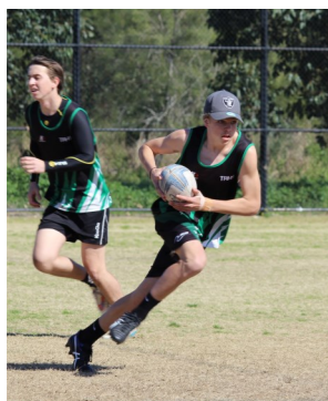
NSW State Touch Champions

TRHS has a strong touch tradition with a number of accolades to their credit including: