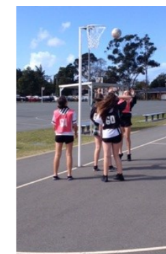
Tweed Regional netball Centre

SDP Netball is conducted at the newly refurbished Arkinstall Park and at TRHS's Sport and Entertainment Centre.