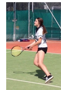
Arkinstall Park, adjacent to TRHS, has undergone substantial up-grades

SDP tennis students have gained FNC, NC and CHS State selection.