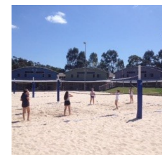
Gold Coast Performance Centre