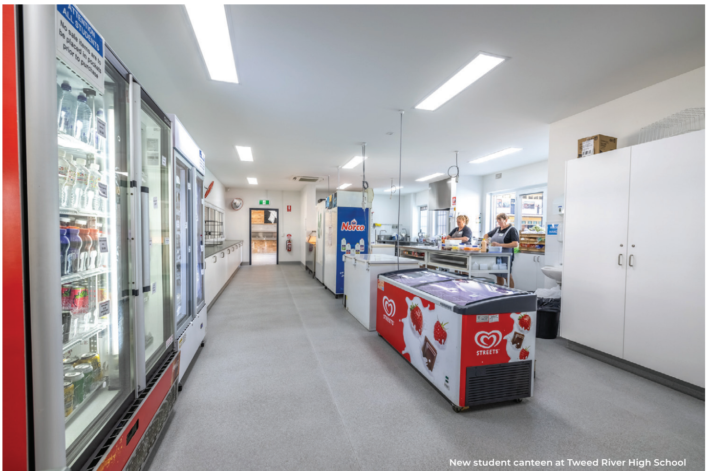
New student canteen at Tweed River High School