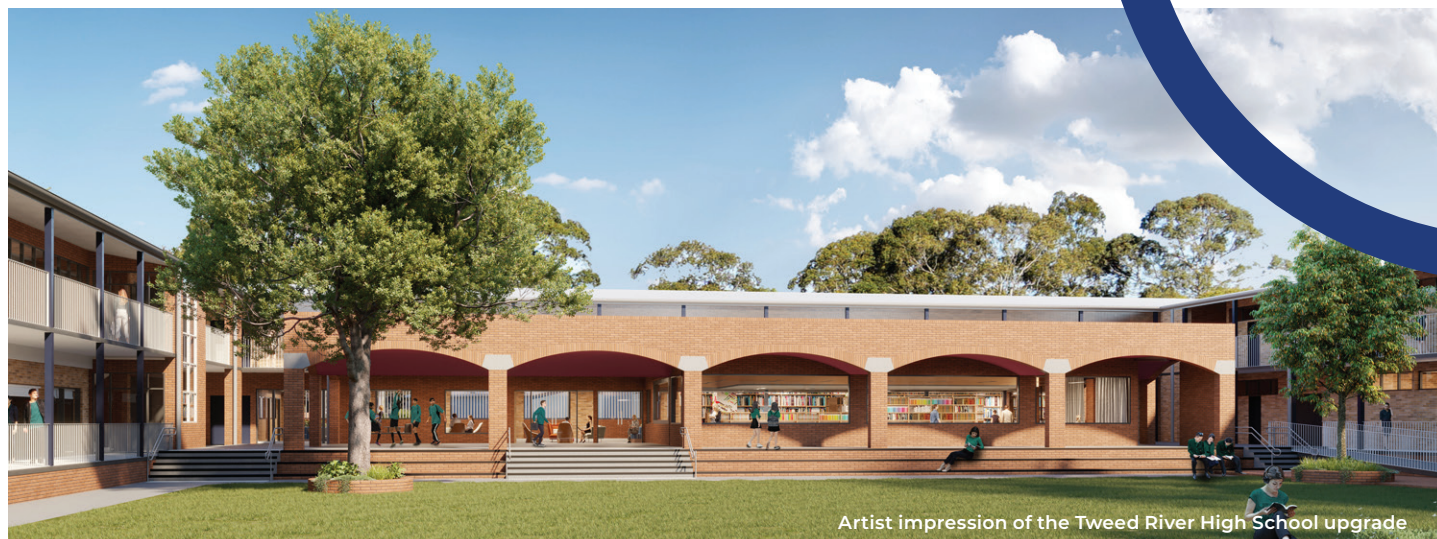
Artist impression of the Tweed River High School upgrade