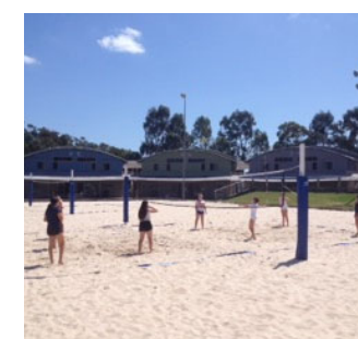
Gold Coast Performance Centre