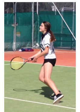
Arkinstall Park, adjacent to TRHS, has undergone substantial up-grades

SDP tennis students have gained FNC, NC and CHS State selection.