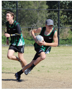
NSW State Touch Champions

TRHS has a strong touch tradition with a number of accolades to their credit including: