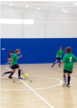
“Futsal is the five-a-side soccer game, mainly played indoors. The game is very popular across South America.”

Our students have captained the Open NSW Boys and Girls state sides, one to National Victory and coached other TRHS students.