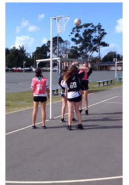
Tweed Regional netball Centre

SDP Netball is conducted at the newly refurbished Arkinstall Park and at TRHS’s Sport and Entertainment Centre.