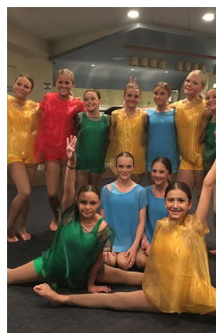
NSW State School Spectacular

Students have the opportunity to further develop their soccer skills at the Gold Coast Performance Centre during the Sport Excellence camp and their refereeing skills at Primary School gala days.