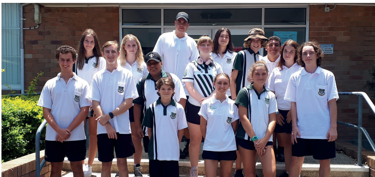
Sport House Captains and Vice Captains for 2020. Turn to page 4 for details.